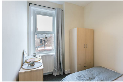
GROUND FLOOR 36 sq ft (3.3 sq m) approx.

Available 26th June 2026 | £1,000pcm | First Floor Tyneside Flat | 661 Sq. ft (61.4 m2) | Great Location | Two Bedrooms | Separate Study | Lounge | Kitchen | Shower Room WC | Good Storage Space | Furnished | On Street Parking | Private Rear Yard | Close To Jesmond Dene | Council Tax Band: A | DG & GCH | EPC Rating: C